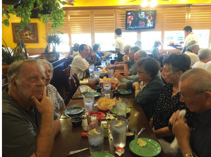
Club Cruise October 1, 2016—travel from tri-cities south and east to Norman ending to share lunch at Mexican restaurant