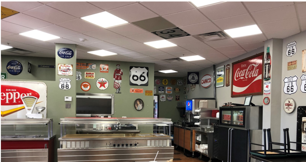
Stop along the way at the Chandler RT 66 Bowling Alley and Cafe