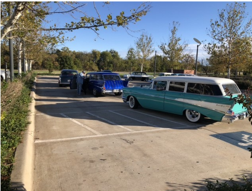
Fall Foliage October 2021 Leaving from Pops on way to Sequoyah State Park