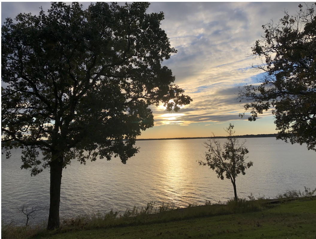
Sequoyah State Park, Fall Foliage 2021