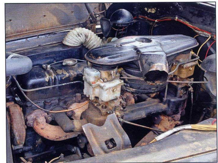
Compound carburetors were optional on 1942 Specials. This one has it.

I checked the list of cars owned by BCA members in the 2017 Membership Roster, to see how many of these 1942 model 47s are in the club. Zero. That's right—none. I told you it was rare! ♦