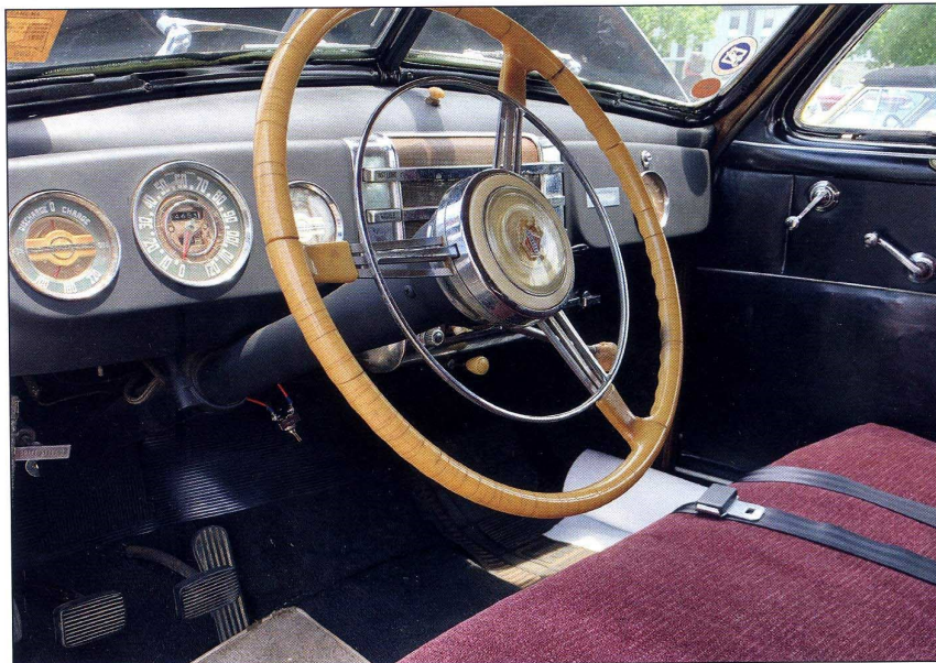
Steering wheel, dashboard and interior of the '42

This particular car was delivered to its first owner on December 3, 1941, only four days before the Pearl Harbor attack which brought the United States into the war. The original owner kept the car until 1951. The second owner had it from 1952 until 1962. The current owner (assuming it did not sell at the meet) has owned it since February 1965. The car has a nice two-tone paint job and was for sale at the meet for $6,500 or best offer. It had some very old gas in the tank and was not running well because of that, which was causing flooding and stickiness in the carburetors. According to the owner, the car has only been driven about 20,000 miles since the engine overhaul in 1970. It probably needs some tender loving care, but nothing major.