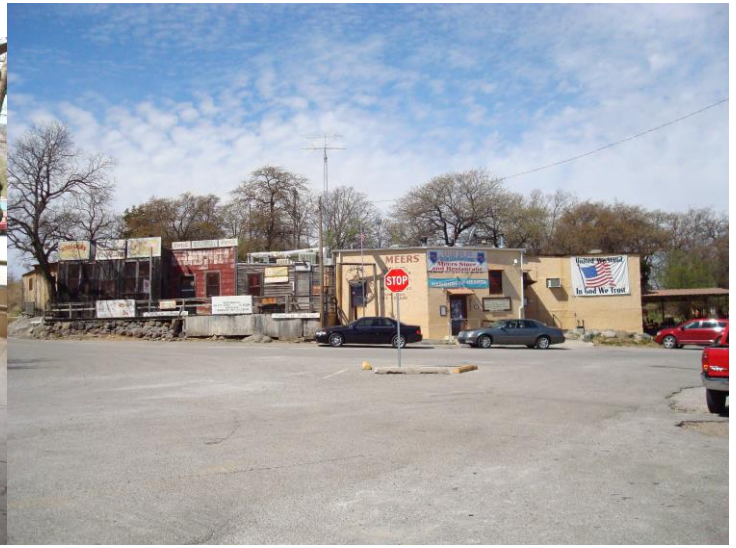
Distinct Absence of Any Golden Arches