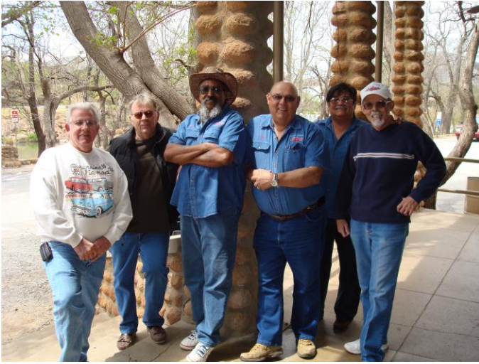
On Our Own and Wives Nowhere in Sight