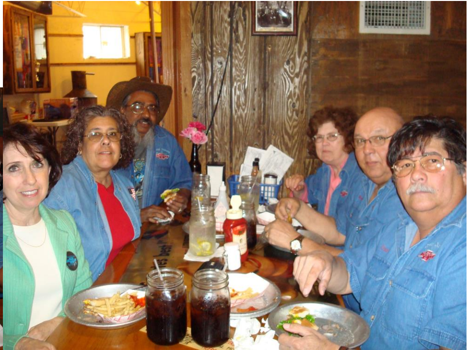
What! No Chopsticks or Rice!